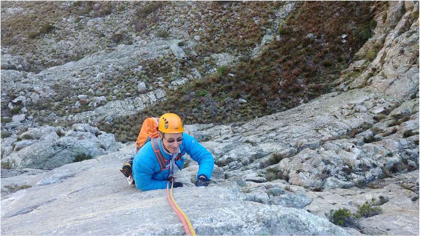
Snort following pitch 2 on Terrific Time.